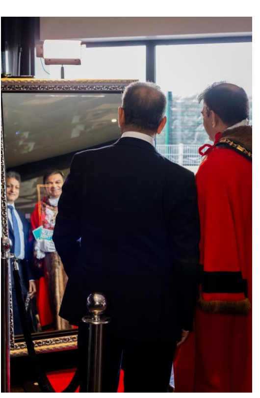
"Thank you for organising this – it was a great event. [child] really enjoyed it, as did I."