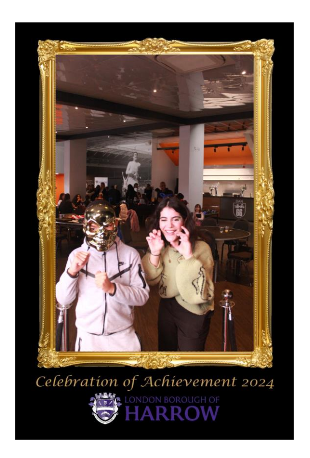
"The pizza is my favourite part!"